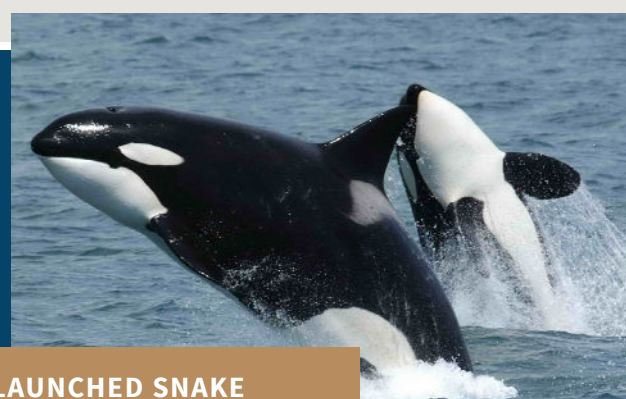
LAUNCHED SNAKE RIVER SAVERS FOR ORCA