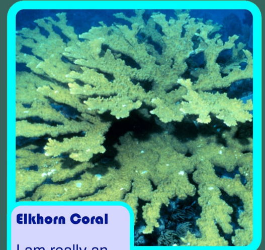
Elkhorn Coral I am really an animal that provides a home to fish