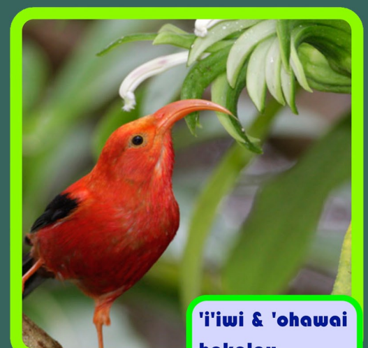
'I'iwi & 'ohawai hakaiau I live in a tropical rainforest