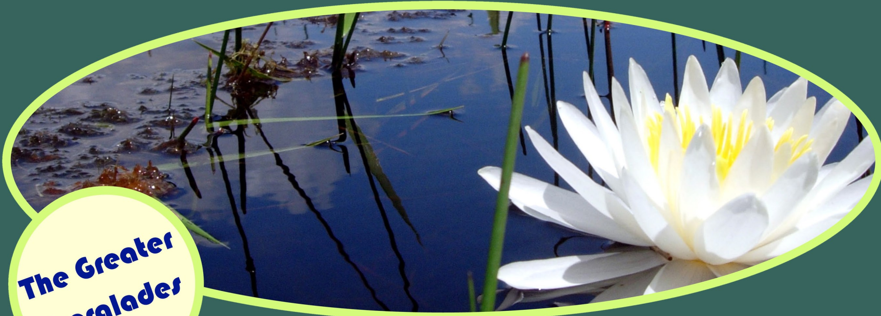
The Greater Everglades

MATCH THE ANIMAL WITH THE ECOSYSTEM IT LIVES IN