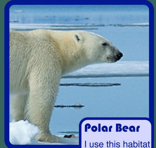
Polar Bear I use this habitat for hunting and long travels