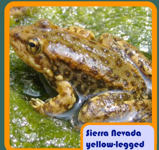
Sierra Nevada yellow-legged frog I live in high mountain lakes and ponds