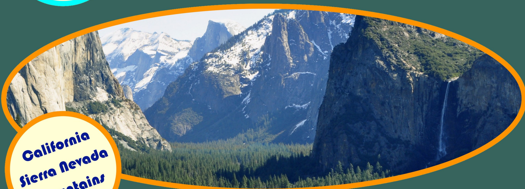
California Sierra Nevada Mountains