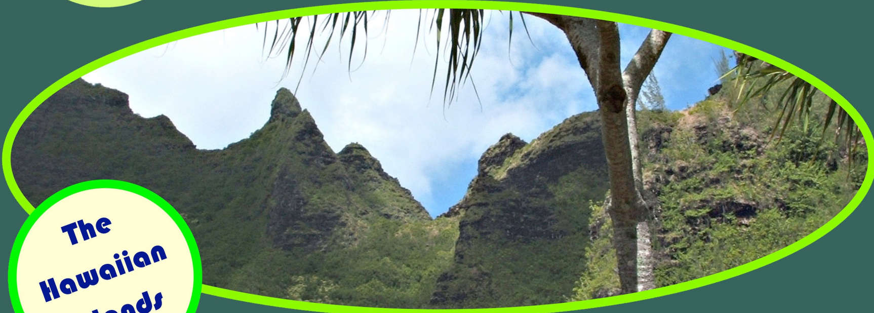
The Hawaiian Islands