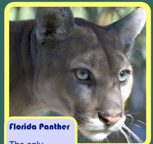
Florida Panther The only breeding population is found here