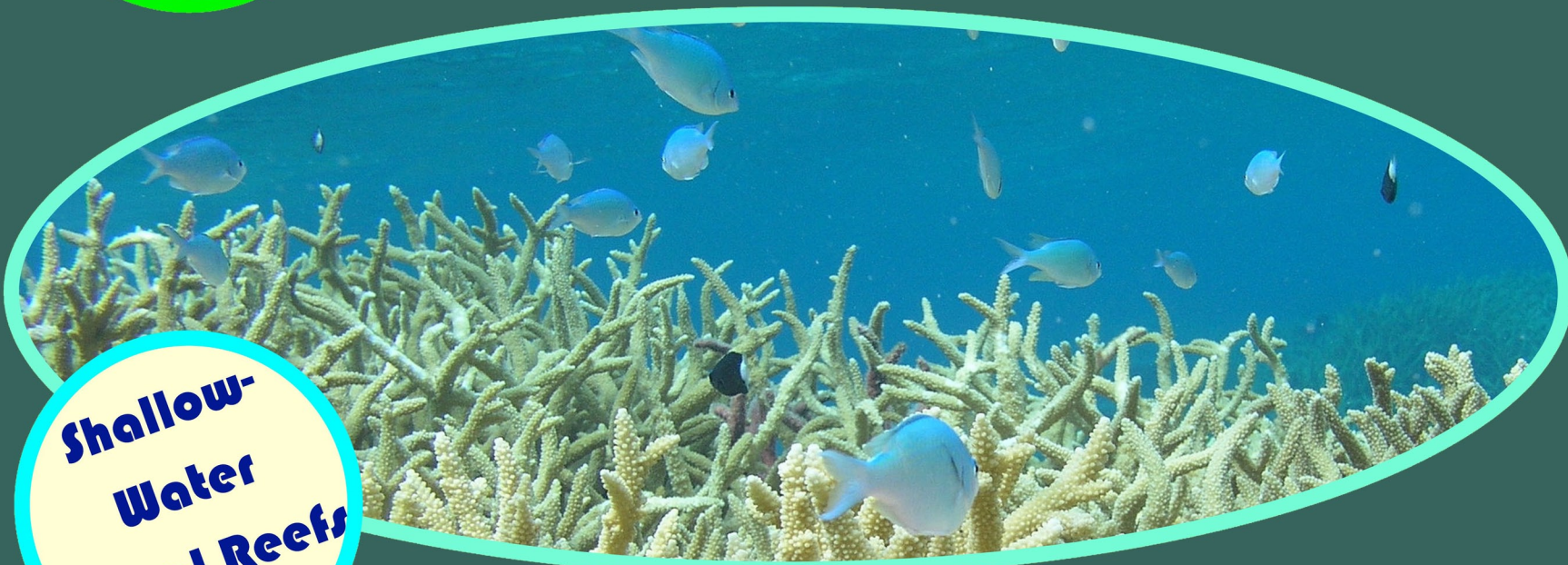
Shallow-Water Coral Reefs